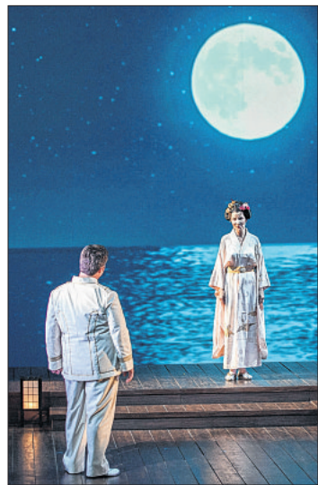
Atlanta Opera opens its season Saturday with "Madama Butterfly."